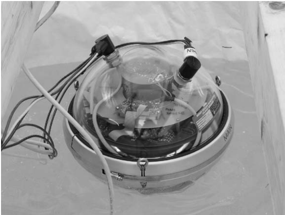
Fig. 2. The first DOM frozen into a prototype IceTop tank at South Pole (January 2004).