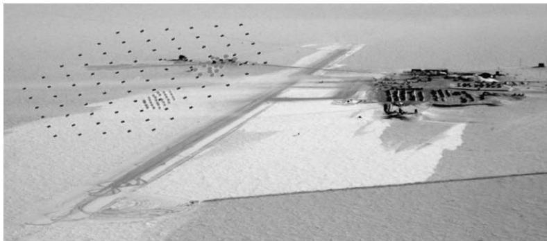
Fig. 1. Aerial view of South Pole and positions of the IceTop tanks resp. the IceCube strings (black), Spase-2 stations (grey, dense, regular foreground pattern [7]) and the AMANDA strings (larger grey pattern).

The DOM mainboard has a free-running timer which needs to be synchronized with nanosecond accuracy to GPS time, requiring re-calibration roughly every minute. As shown in Fig. 3, a surface circuit sends a bipolar signal at a GPS-latched time t_1 , received at a time t_2 . After a certain, fixed time interval \delta_t , an identical circuit in the DOM sends an identical bipolar pulse to the