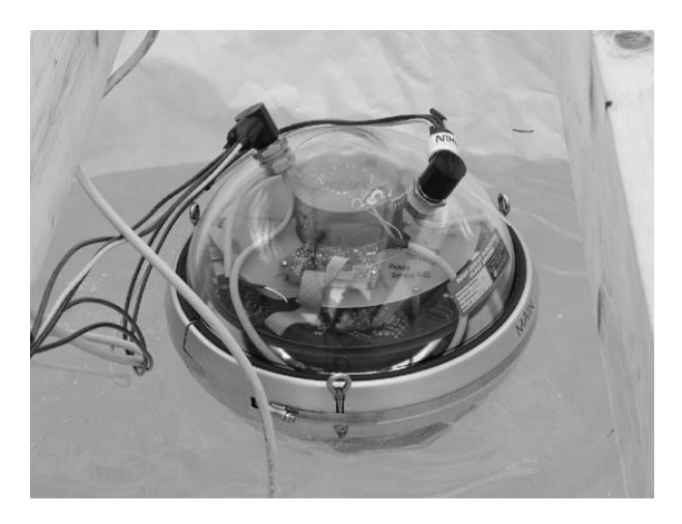
Fig. 2. The first DOM frozen into a prototype IceTop tank at South Pole (January 2004).